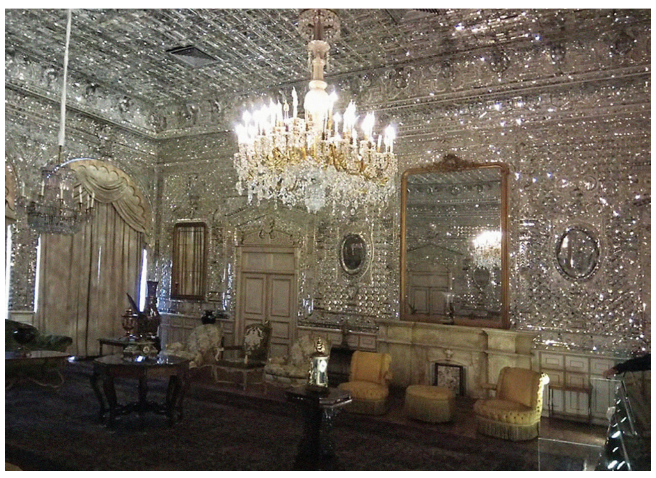
1. Mirrored interior of Golestan Shah palace in Tehran.

heritage of mirrored interiors of Iran and who studied the interiors of Golestan, palace of the shah [9]. However, there are no special studies focusing on the heritage of "crystal" palaces, mosques and holy places of Persia.