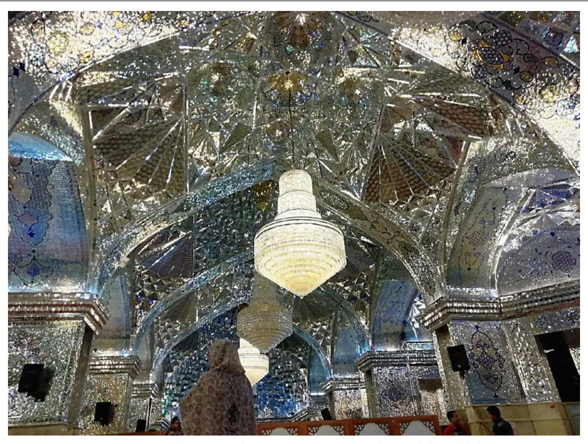
3. Interior and stalactite vaults of Mirrored Mosque in Shiraz.

residence), Gavam palace in Shiraz (in combination with refined and delicate stucco), and large number of religious monuments in different regions of contemporary Iran. At the present time the total number of such monuments amounts to several hundreds. Mirrored-style interior of some of them was designed and implemented just recently, at the beginning of the 21st century.