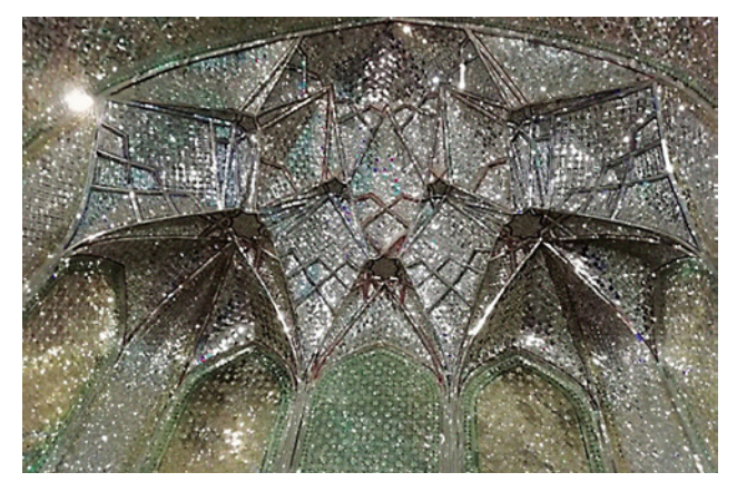
4. Interior and mukarnases of Ali Ibn Hamzeh in Shiraz.

The general conclusion is that tradition of such interiors, which was especially popular in Persia since 19 century, is continued and actively developing at the present time. Moreover, the certain unity in style and aesthetics of early prototypes and contemporary solutions should be noted, because in construction and imagery features they follow the achievements of Qadjar epoch, mainly of legendary Nasreddin Shah. In line with that, the mosques and holy places with more modest decoration have mirrored elements in women's and men's praying parts. The alcove is built inside such premises; it is often decorated by applied friezes with glass flowers and small mukarnases.