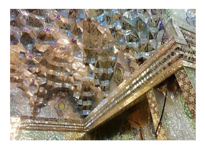
3. Interior and stalactite vaults of Mirrored Mosque in Shiraz.

In general, Islamic interiors of the 17<sup>th</sup> century, were common in wealthy Georgian buildings. In the nineteenth century, some wealthy families within the limits of historicism tried to continue the tradition of exotic interiors in Tiflis, including those that were carried out in traditions