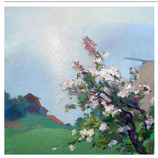
2. V. Zakharchenko. Spring Day. 2008. Oil on canvas

notes [11] in some of his portraits, as they are characterized by passion, energy, sharpness, hot palette, while in others even the mood of Goya [4] is noticed, demonstrated by the approach to tenebrism, the noisy language of painting, the courage and contrast, while in the genre of landscape the artist's style of painting is closer to impressionists; it is soft and tender. Zakharchenko is an excellent colorist, he has a high level of not only the technique of painting, but also the mastery of the composer. It is the organization of the space of the painter's landscape that draws attention to typical solutions. The compositional patterns of landscape paintings are distinguished by either very artificially low (which happens occasionally), or high line of the horizon. The latter contributes to the sense of the presence of air, free breathing in the space of the canvas, freshness and freedom. It's noteworthy, that the author often prefers a square format, which gives the works balance.